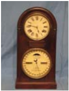
75: Ithaca Round Top parlor calendar clock

Mahogany case with 4 columns 13" w x 14" t Ca. 1900