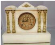
4: Ansonia 4 Column mantle clock.