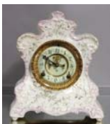
30: Ansonia China Clock

Walnut & Rosewood case. Double columns, replacement dial, time & strike. 10 1/2" w x 16" t Ca. 1870