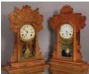
239: Ingraham Mantel clocks