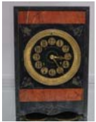
40: W.H. Glenny Son & Co Marble & Slate shelf Clock

Floral decorated, Porcelain dial, time & strike. 8 day movement. 11" t x 7 1/2" aw Ca. 1910