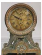
430: SethThomas Long Alarm Model