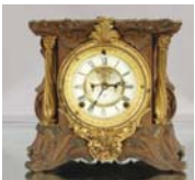
150: Ansonia Mantel Clock

Enameled case, Porcelain Dial, Time & Strike. 13" t Ca. 1900