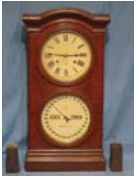
73: Seth Thomas No. 1 Calendar Clock