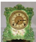
203: Gilbert Porcelain Mantel Clock

Embossed surround, Porcelain Roman numerals. 14" d. Ca. 1900