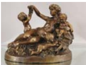
305: Bronze Sculpture of Nude Woman and Children

Spelter figure of Gladiator on enameled iron base. Porcelain dial, open escapement. 22" t x 20" w. Ca. 1885