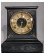
53: Ansonia Victorian style cast iron mantel clock