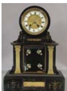
177: French Empire Style Slate Mantel Clock