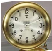
244: Chelsea U.S. Maritime Commision Ships Bell Clock