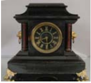
164: Ingraham Princess Marti Clock

Original label on bottom. Brass Dial, Time & Strike. 17" w x 11" t Ca. 1900