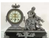
206: Ansonia Shakespeare Figural Mantel Clock

Mahogany case. Fancy brass face & dial. Westminster Chimes. 16" t x 13" w. Ca. 1900