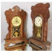
429: 2 Oak Mantel Clocks