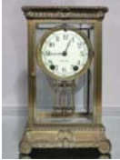
21: Seth Thomas crystal Regulator

Ebonized iron case, bronze applied decorations. Time & strike. 14" t x 11" l Ca. 1890