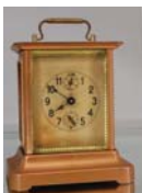
431: Junghans Alarm Clock