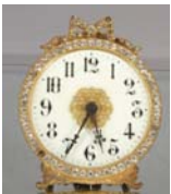
169: Ansonia Novelty Clock

Rosewood case, Time & Strike. Fancy Pendulum with alarm. Ca. 1880 15" t x 16" w.