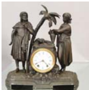
280: Seth Thomas & Sons Double figural mantle clock