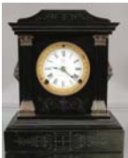
149: Ansonia Iron Mantel Clock

Original stencil on door, Time & Strike. 15" w x 23" t. Ca. 1890