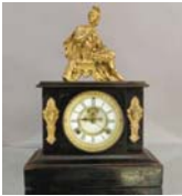
400: Ansonia Figural Cast Iron Mantel Clock

Ansonia & Waterbury. 9" t x 11" w. Ca. 1880