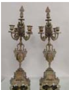
402: Pair of French Renaissance style spelter Candelabr

Gothic Style with figural design on all sides. Porcelain Roman Numerals. Time only 7" t x 6" d. Ca. 1860