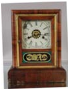
23: Early Gilbert Shelf clock

Original dial & stencil on door. 23" t x 15" time & strike. Ca. 1890