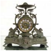
237: French Renaissance Revival style case iron mantle

Lot of 2. E. Ingraham is 12" x 20", Gilbert is 13" x 21" . CA. 1890