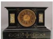
234: Ansonia Iron Mantel Clock

In Oak & Birdseye Maple case. 9" w x 17" t. Ca. 1910