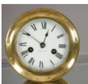
259: Waterbury Ships Bell Clock

In Walnut Case. Westminster Chimes. 13" w x 19" t Ca. 1890