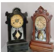
383: 2 Walnut Shelf Clocks