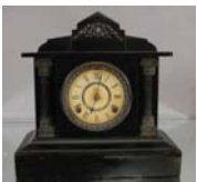
171: Waterbury Iron Mantel Clock

Walnut case, Statue of Liberty stenciled on door. Time & I Strike with alarm. 21" t x 13" w. Ca. 1900