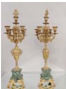
303: Pair of French Louis XV Candleabras

Spelter. Figure of woman with bird. Decorated Porcelain dial. Time & Strike. Japy Freres movement. Ca. 1880 23" t. X 12" w