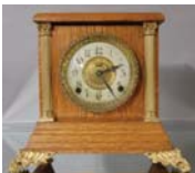
26: E. Ingraham Oak Shelf Clock

Crested Bird in the nest. Gargoyles on sides. Sunburst picture frame. Enameled numbers. 19" t x 9" w. Ca. 1890