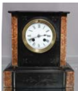
45: French Marble & slate clock

Walnut case, Porcelain Roman numerals, time & strike with Thermometer & barometer. 36" t x 13" d Ca. 1880