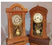
339: 2 Oak mantel clocks

Gilbert 22" t Seth Thomas 19" t. Ca. 1880