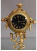
210: French Louis XVI style parlor clock

With Reverse painted door, 2 weight mount with shelf. Original label on inside. 21" w x 7" t Ca. 1860