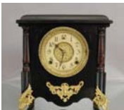
215: Gilbert Pocono model mantel clock

Walnut case with great original labels on insides. 14" w x 27" t Ca. 1875