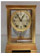
232: Seth Thomas crystal regulator

Porcelain dial, beveled glass on all sides. 7" w x 11" t. Japy Freres Movement. Ca. 1906