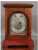
240: Gustav Becker Bracket clock

lot of 2 in carved oak cases. Time & strike. 21" t Ca. 1900