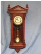
77: German R.A. Regulator

with glass dome. 7" w x 11 1/2" t Ca. 1880