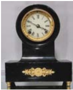
20: E. Ingraham Mantel Clock

Mahogany case, porcelain dial, Time & strike. 18" w x 8" t . Ca. 1910