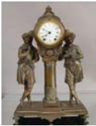
301: Seth Thomas & Sons Double Figural Mantel Clock

With Westminster chimes, triple wind. 18" t x 12" w. Ca. 1900