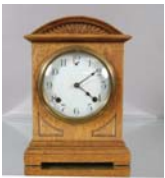
79: Session Oak Shelf Clock

Decorators case, Time & strike, 8 day movement. 11" x 11" Ca. 1900