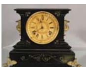
204: Ansonia Mantel clock

Decorated case. # 429, 10" t x 9" w. Ca. 1900