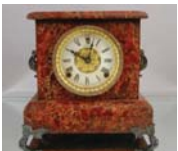
78: Session Mantel Faux Red Marble Clock

Porcelain dial, Time & strike 13 " w x 33" t