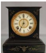
199: Ansonia Cast Iron Mantel Clock