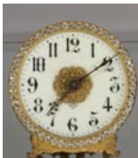
175: Ansonia Novelty Clock

Gilded Case, Beveled glass on all sides, Porcelain Dial, Time & Strike. 12" t x 8" w Ca. 1890