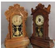
428: 2 Waterbury Oak Mantel Clocks