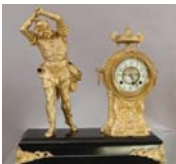
304: New Haven Figural Mantel Clock