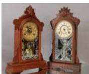
285: 2 Gilbert Walnut Mantel clocks