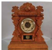
127: E.N. Welch Oak Shelf clock