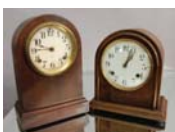
385: 2 shelf clocks

Mahogany case. Beveled Glass Door, time & strike. Gong, Germany ca. 1910 11" t x 8" w.