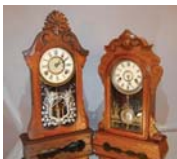
338: 2 Walnut mantel clocks

in enameled wood case. Time & Strike. With original label. Ca. 1905