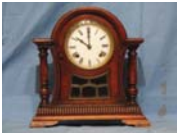
74: German Mantel column Clock

Walnut case Original label. 17" w x 33" t Ca. 1860