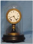
76: Seth Thomas Candle stand clock

With original labels, walnut case. 11. 1/2Mahogany case with 4 columns Ca. 1900 w x 22 1/2" t Ca. 1868