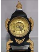
37: Ansonia Shelf clock.