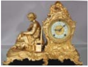
1: Ansonia Vassar Figural mantel clock.