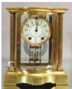
96: Seth Thomas Crystal Regulator Clock

Original Stencil on door with birds, fancy pendulum. Time & strike, 22" t x 12" w Ca. 1890