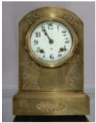
39: Art Nouveau style Bronze Ansonia clock

Blue porcelain dial, signed W & H Sch. 1, 14" t x 8" w. Ca. 1870