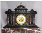
27: French Renaissance style Marble & slate mantel clock

2 fluted columns, applied Bronze decorations. 11" t x 12" w Ca. 1900