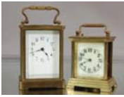
299: 2 Brass Carriage clocks

New Haven & Seth Thomas. Original labels on inside. 14" t Ca. 1860