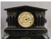
216: Gilbert 6 Column mantel clock

Enameled case, original label on bottom . 12" t x 12" w Ca. 1902