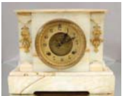
167: Waterbury Onyx & Brass mantel clock

Enameled iron case with Shepherd sttature on top. Gilted trim, claw footed. 17" t x 13" w. Ca. 1900