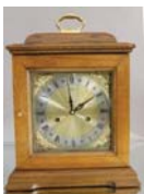
382: Ridgeway Oak Bracket Clock

Mounted on Cherry 15" l x 7" w. Ca. 1895