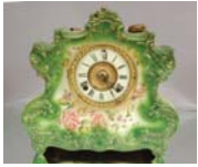
226: Ansonia Porcelain Clock