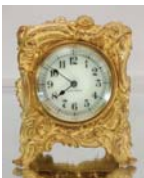
405: Seth Thomas Gilted Rococo style clock

with porcelain dials. 4" t. Some losses.