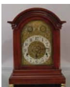
33: German Excelsior Bracket Clock

Fancy brass dial with applied decoration, Time & Strike. 12" l x 16" w. Ca. 1900