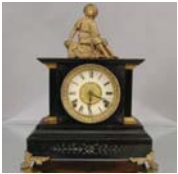
166: Figural Mantel clock

Oak Case, Time & Strike. 24" t ax 11" w. Ca. 1910