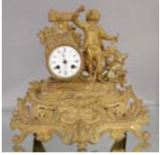
137: French Gilted Figural clock

Works signed H & H. Porcelain dial with hairline crack. 3" w x 5 1/2" t. Ca. 1890