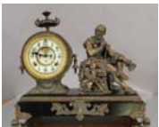
151: Ansonia Shakespeare Figural mantel clock

Fancy iron case with brass columns & floral decorations. Porcelain dial, open escapement. 10" t x 10" w Ca. 1890