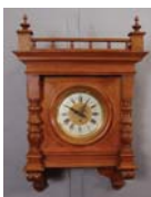
180: Gustav Becker Oak Balcony Clock

Oak Case, Short Drop, Time only 25" t x 17" w. Ca. 1900