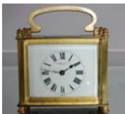
50: Bronze French Carriage Clock

Porcelain dial & face. Beveled glass on all sides. 6" t x 3" w. France