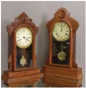
236: Walnut Mantel clocks

11" w x 26" t. German movement. Ca. 1920