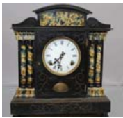
94: French style mantel clock

Iron case with brass trim, Time & strike. 13" t x 8" w. Ca. 1900