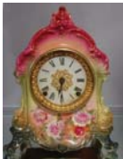
46: Ansonia La Ramble China clock