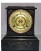
36: Ansonia iron case mantel clock

French Louis XV style. Hand painted porcelain plaque. Time & Strike 13" t x 8" w. Ca. 1880