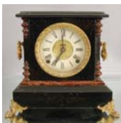
200: Ingraham Mantel Clock

Enameled case. Time & Strike. 10" t x 9" w. Ca. 1890