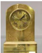
403: Ansonia Art Nouveau style Bronze cabinet clock