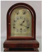
146: German Bracket Clock

Triple Wind, Westminster Chimes. 12" t x 23" w. Germany