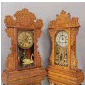
274: 2 Oak Kitchen Clocks

with Westminster Chimes. 18" t x 11" w. Ca. 1910