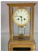
231: French Crystal regulator

Enameled Wood Case, faux decorated 4 columns on claw footed base. Time & Strike, partial original label. Ca. 1900 11" t x 17" w