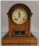
398: Ingraham Corna Model Shelf Clock

Ingraham 9" w x 11" t; German 10" w x 13" t. Ca. 1900