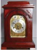
2: German Junghans Bracket Clock

Spelter figural woman standing. Enameled dial. Time & Strike, signed Ansonia. Works signed Ansonia Clock Co. Ca. 1890