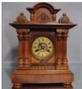
43: German Shelf Clock

4 Columns decorated wood case. Time & strike. Original label on bottom. 17" w x 11" t Ca. 1900