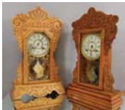
424: 2 New Haven Oak Mantel Clocks