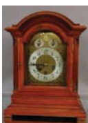
205: Junghans Bracket Clock

Enameled iron case. Time & Strike. 11" t x 13" w. Ca. 1900