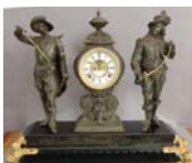
201: Ansonia Double Figural mantle clock.

Enameled wood case. Brass Decorated on claw feet. Partial label on back. Time & strike. 12" t x 11" w Ca. 1900