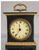
427: Victorian cast Iron Alarm Clock