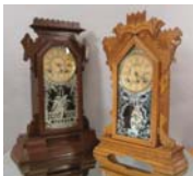
425: 2 Ansonia Wood Mantel Clocks