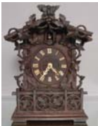
212: Rare Black Forest Coo Coo Shelf Clock