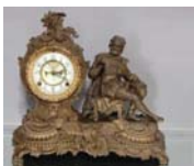
51: McBeth Ansonia Figural clock

Porcelain dial. A. Stoqell & Co. Boston. 4" t x 3" w Ca. 1900