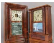
287: 2 early Ogee Shelf Clocks

enameled case. Time & strike. 11" t x 15" w. Ca. 1890