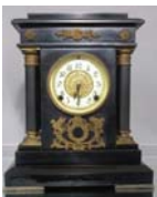
9: New Haven 4 Column Mantel Clock