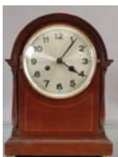
178: German Shelf Clock

Porcelain Dial with Bronze decorations. No Pendulum, some losses. Ca. 1880 17" t x 13" w.