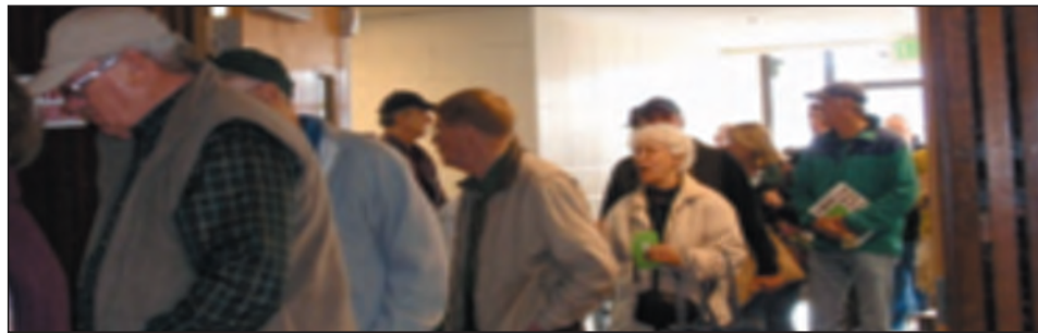
Eager customers lined up at opening time for the January 2012 show.

To learn more about Bruhns Auction Gallery, call 303-744-6505 or e-mail them at bruhnsauction@aol.com . To learn more about LiveAuctioneers go to www.LiveAuctioneers.com .