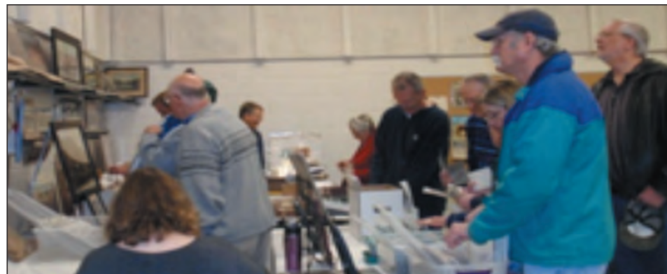
Customers find treasures at the January 2012 show.

Gather the family and come on out for a fun day at the Denver Postcard & Paper Show!