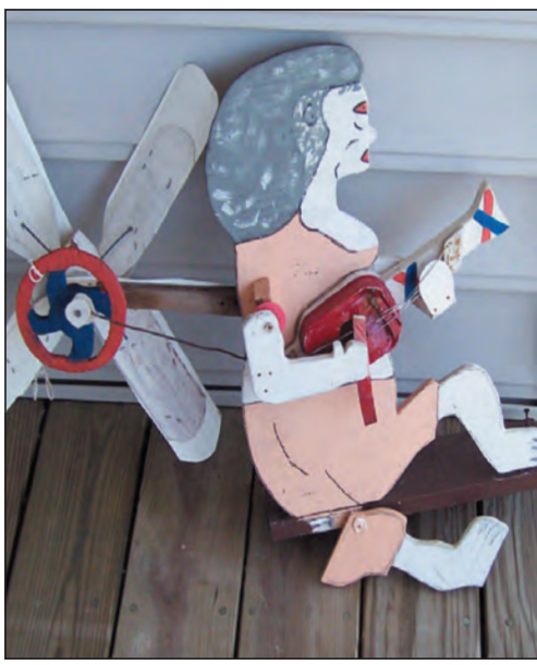
ANTIQUE DETECTIVE Q & A PAGE 11